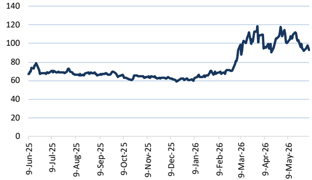
Oil: Generic 1st Crude Oil, Brent (USD/Barel)