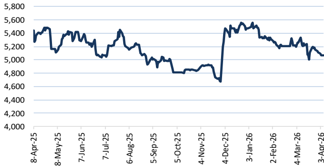
Nickel: London Metal Exchange Nickel Future (USD/MT)