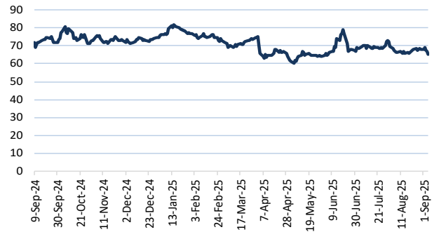
Oil: Generic 1st Crude Oil, Brent (USD/Barel)