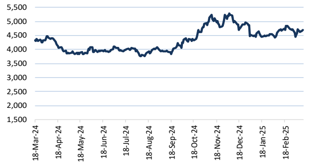
CPO: Bursa Malaysia Crude Palm Oil (MYR/MT)