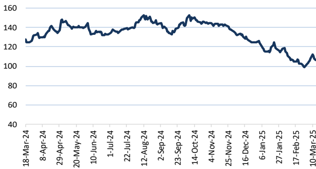
Coal: Newcastle Coal (USD/MT)