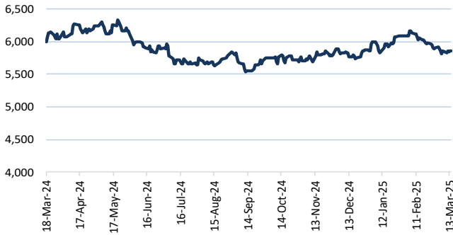
Pulp: Generic Bleached Softwood Craft Pulp (CNY/MT)