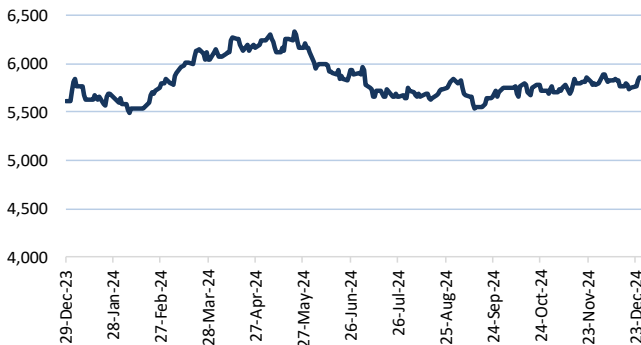
Pulp: Generic Bleached Softwood Craft Pulp (CNY/MT)