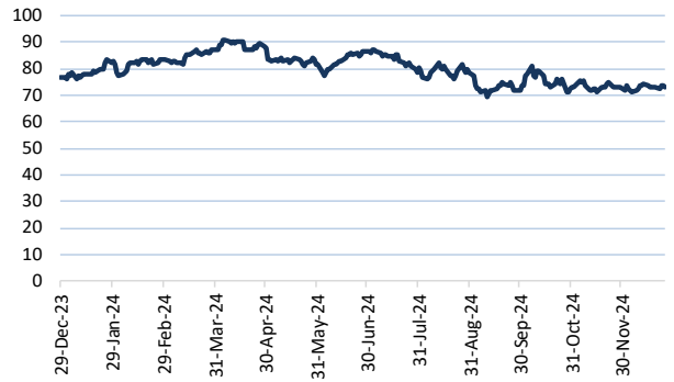
Oil: Generic 1st Crude Oil, Brent (USD/Barel)