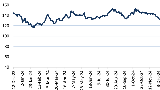
Coal: Newcastle Coal (USD/MT)