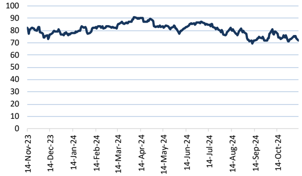
Oil: Generic 1st Crude Oil, Brent (USD/Barel)