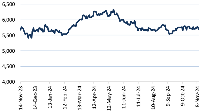
Pulp: Generic Bleached Softwood Craft Pulp (CNY/MT)