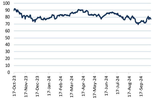
Oil: Generic 1st Crude Oil, Brent (USD/Barel)