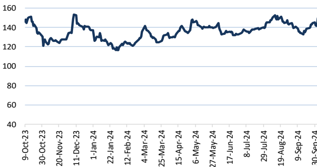
Coal: Newcastle Coal (USD/MT)