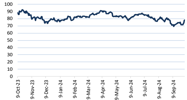
Oil: Generic 1st Crude Oil, Brent (USD/Barel)