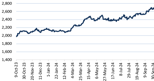
Gold: Gold 100 Oz Futures (USD/Troi oz)