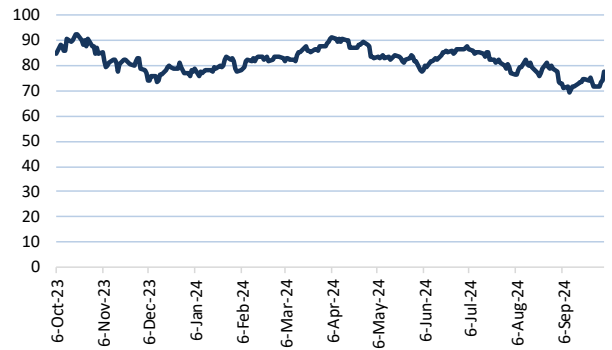
Oil: Generic 1st Crude Oil, Brent (USD/Barel)