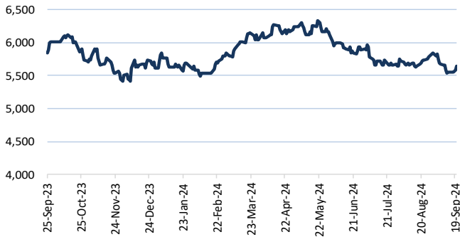
Pulp: Generic Bleached Softwood Craft Pulp (CNY/MT)