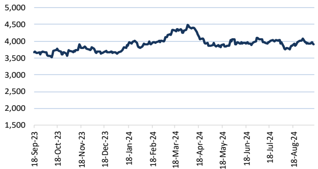
CPO: Bursa Malaysia Crude Palm Oil (MYR/MT)