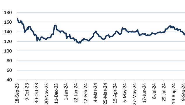
Coal: Newcastle Coal (USD/MT)