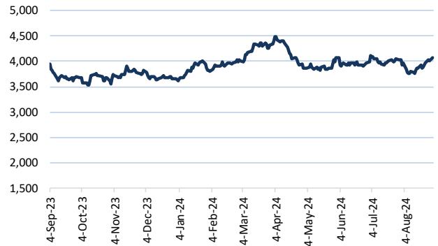
CPO: Bursa Malaysia Crude Palm Oil (MYR/MT)