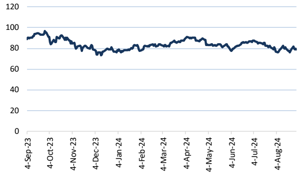
Oil: Generic 1st Crude Oil, Brent (USD/Barel)