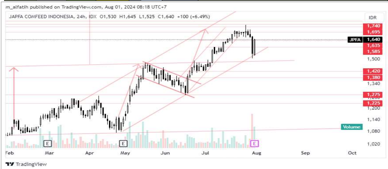
JPFA (1640); BUY-TP @1695-1740; Cutloss <1585. Upchannel (pattern since Apr24)