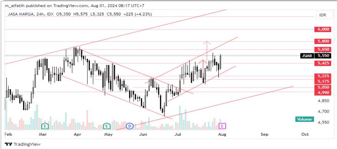
JSMR (5550); BUY-TP @5650-5800; Cutloss <5425. Upchannel (pattern since Jun24)