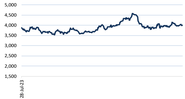
CPO: Bursa Malaysia Crude Palm Oil (MYR/MT)