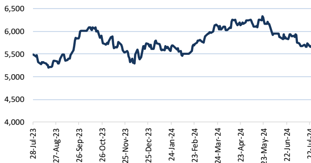
Pulp: Generic Bleached Softwood Craft Pulp (CNY/MT)