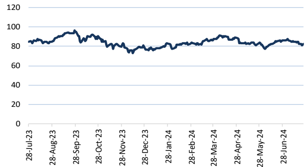
Oil: Generic 1st Crude Oil, Brent (USD/Barel)