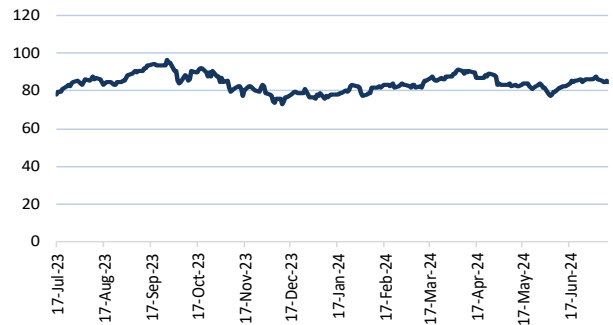
Oil: Generic 1st Crude Oil, Brent (USD/Barel)