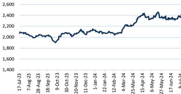
Gold: Gold 100 Oz Futures (USD/Troi oz)