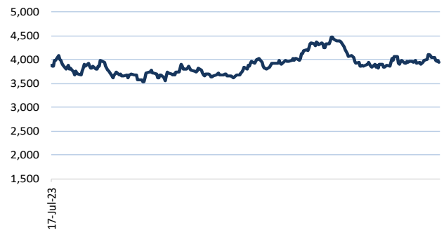
CPO: Bursa Malaysia Crude Palm Oil (MYR/MT)