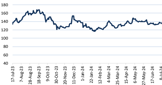
Coal: Newcastle Coal (USD/MT)