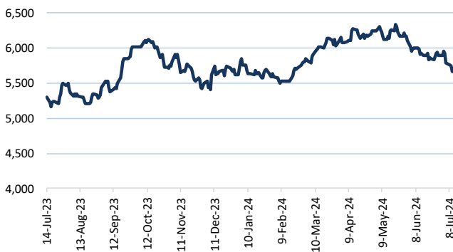
Pulp: Generic Bleached Softwood Craft Pulp (CNY/MT)