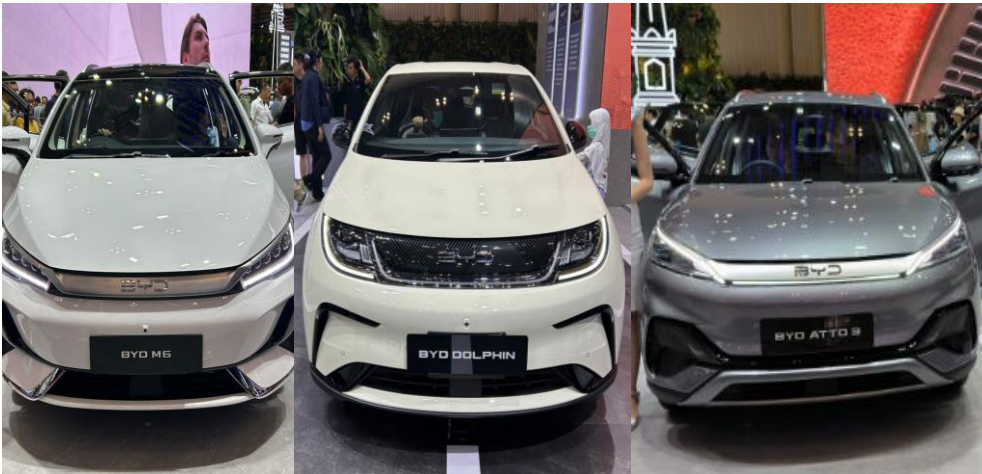
Figure 2. BYD

Large crowds expressed interest in new 4W models from several brands