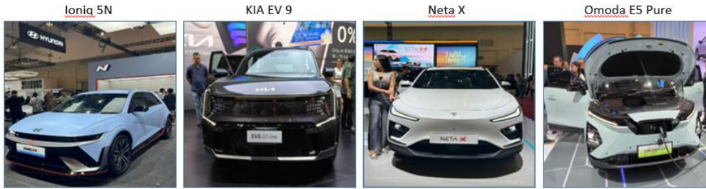
Figure 4. New 4W EV in GIIAS 2024

Several existing brands also introduced their newest EV models, including Hyundai, KIA, NETA, and Chery