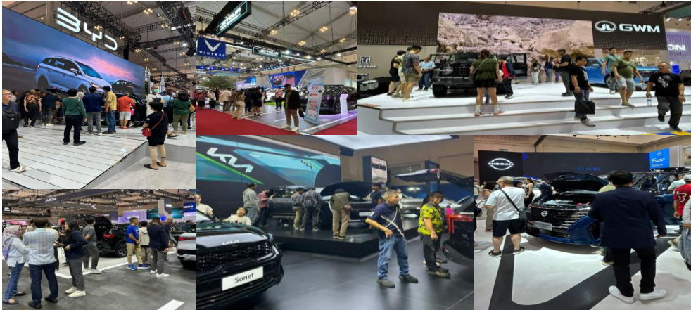
Figure 1. Plenty of visitors at GIIAS 2024