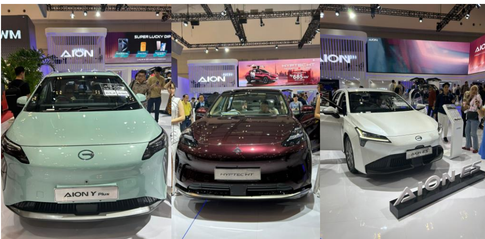
Figure 3. GAC AION

At GIIAS 2024, BYD brought over three new EV models with its M6 capturing the most attention