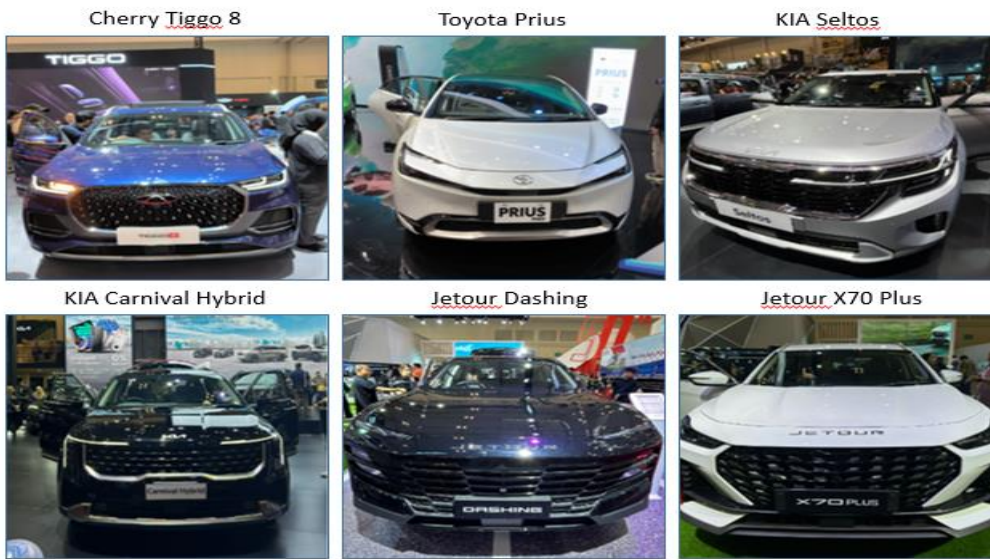
Figure 5. New 4W Hybrid & ICE in GIIAS 2024

EV was not the sole theme in GIIAS 2024 with several brands showcasing their latest hybrid and ICE models