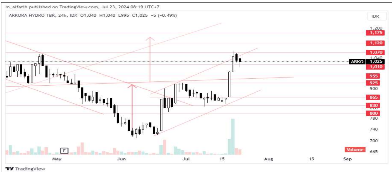
ARKO (1025); BUY-TP @1070-1120; Cutloss <1010. Triangle pattern (since May24)