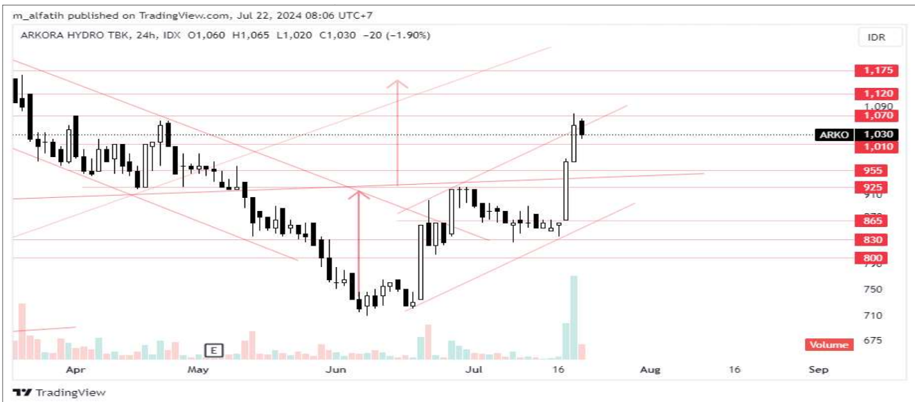
ARKO (1030); BUY-TP @1120-1175; Cutloss <1010. Triangle pattern (since May24)