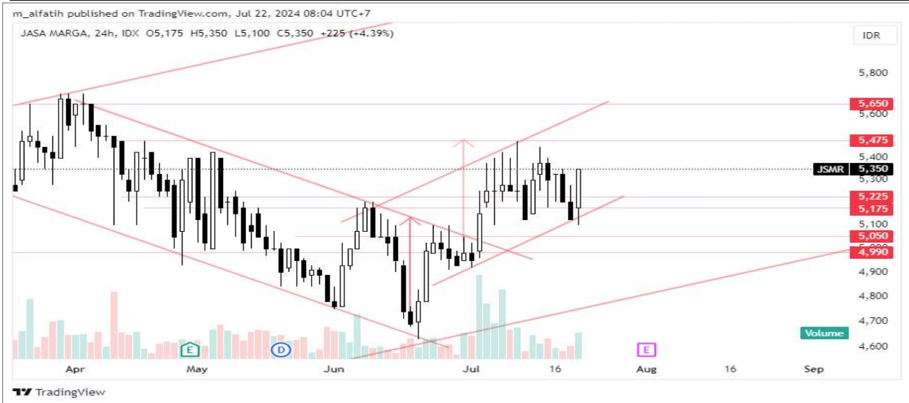
JSMR (5350); BUY-TP @5475-5650; Cutloss <5525. Upchannel (pattern since Jun24)