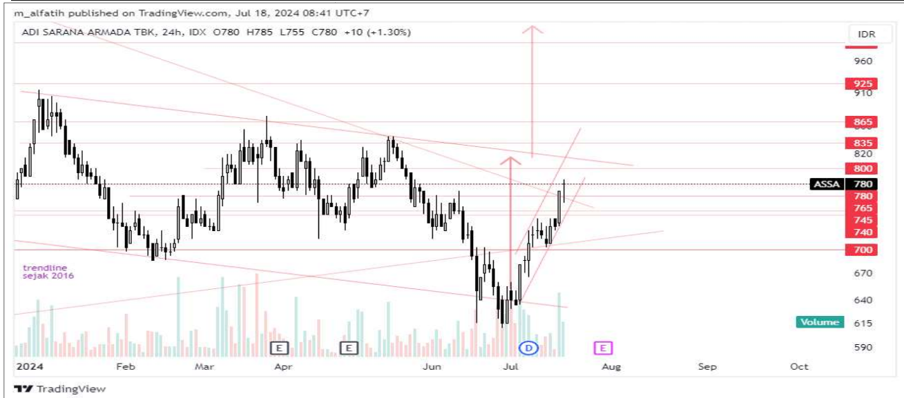
ASSA (780); BUY-TP @800-815; Cutloss <755. Upchannel (pattern since Jul24)