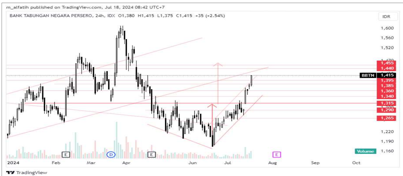
BBTN (1415); BUY-TP @1440-1455; Cutloss <1395. Strong buy after triangle, near TTP (pattern since May24)