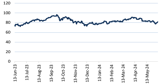
Oil: Generic 1st Crude Oil, Brent (USD/Barel)