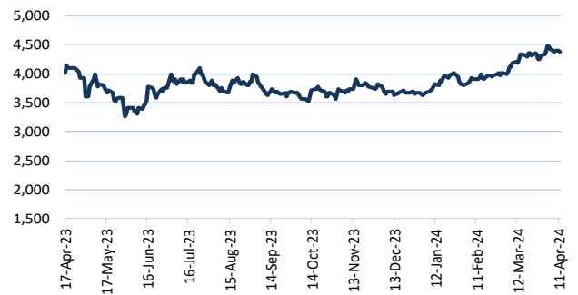
CPO: Bursa Malaysia Crude Palm Oil (MYR/MT)