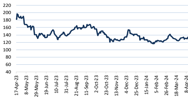
Coal: Newcastle Coal (USD/MT)