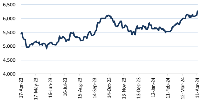
Pulp: Generic Bleached Softwood Craft Pulp (CNY/MT)