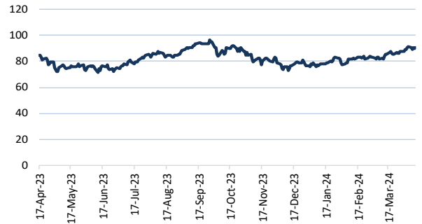
Oil: Generic 1st Crude Oil, Brent (USD/Barel)