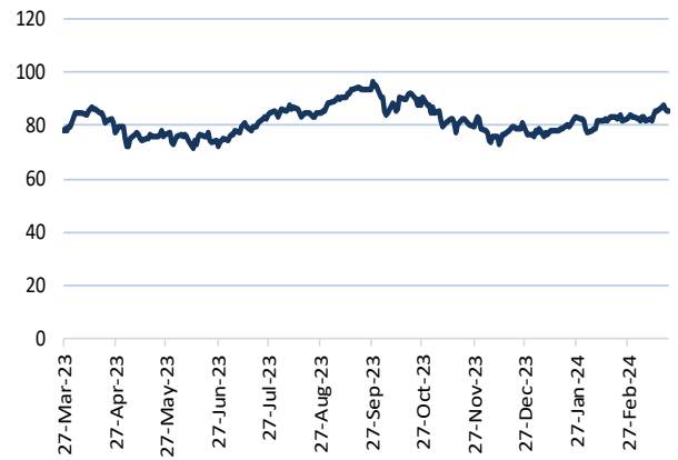
Oil: Generic 1st Crude Oil, Brent (USD/Barel)