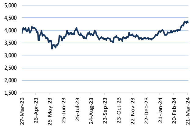
CPO: Bursa Malaysia Crude Palm Oil (MYR/MT)