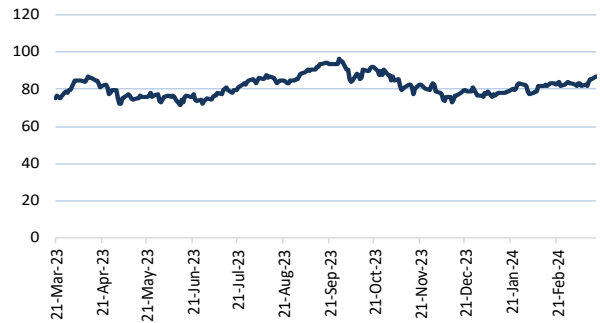
Oil: Generic 1st Crude Oil, Brent (USD/Barel)