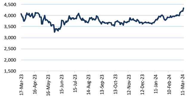
CPO: Bursa Malaysia Crude Palm Oil (MYR/MT)