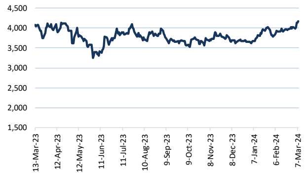
CPO: Bursa Malaysia Crude Palm Oil (MYR/MT)