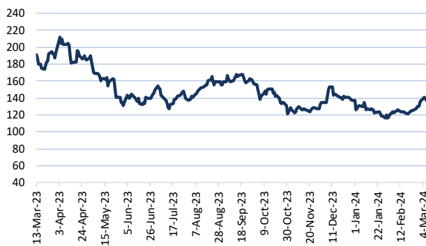
Coal: Newcastle Coal (USD/MT)