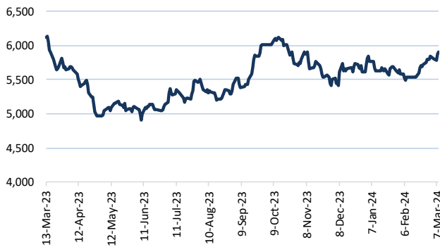
Pulp: Generic Bleached Softwood Craft Pulp (CNY/MT)