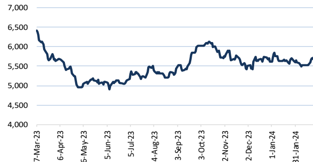
Pulp: Generic Bleached Softwood Craft Pulp (CNY/MT)