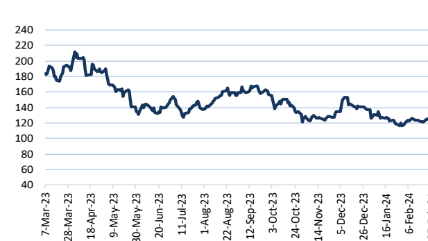
Coal: Newcastle Coal (USD/MT)