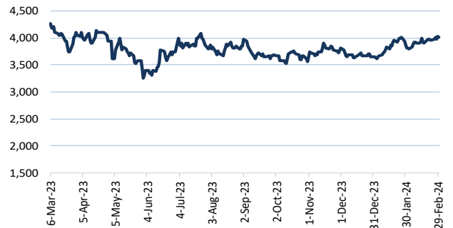
CPO: Bursa Malaysia Crude Palm Oil (MYR/MT)