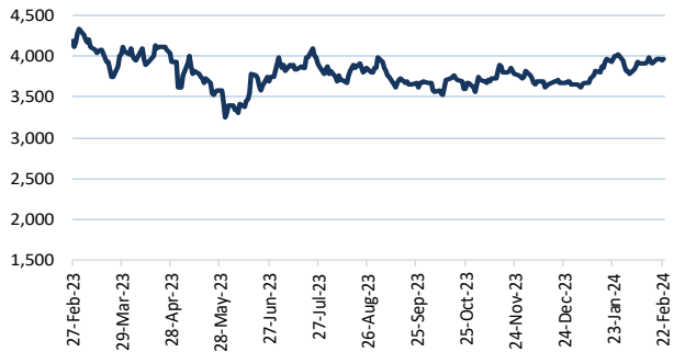
CPO: Bursa Malaysia Crude Palm Oil (MYR/MT)