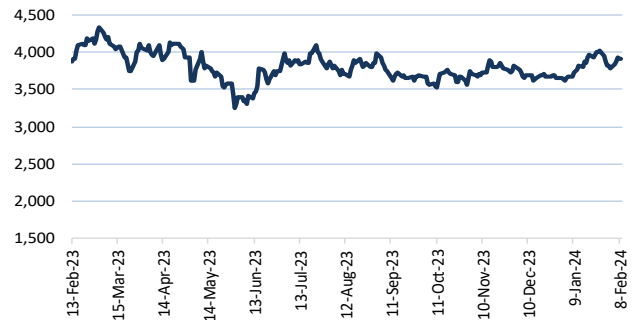
CPO: Bursa Malaysia Crude Palm Oil (MYR/MT)