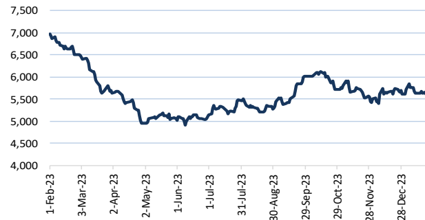
Pulp: Generic Bleached Softwood Craft Pulp (CNY/MT)