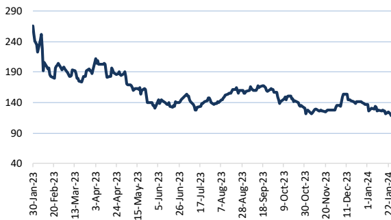
Coal: Newcastle Coal (USD/MT)