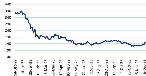
Coal: Newcastle Coal (USD/MT)