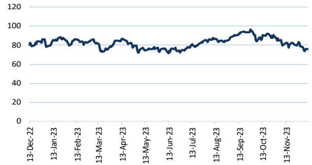
Oil: Generic 1st Crude Oil, Brent (USD/Barel)