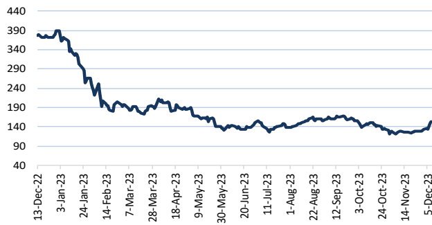
Coal: Newcastle Coal (USD/MT)