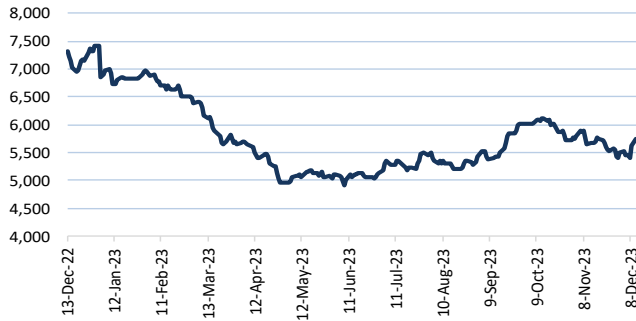
Pulp: Generic Bleached Softwood Craft Pulp (CNY/MT)