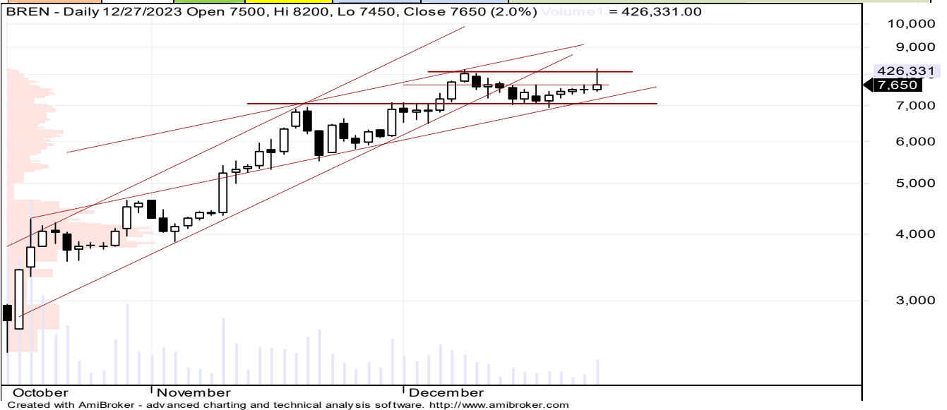
BREN (last 7650) - SELL. Target 7525-7375. Cover >7800. Probable double top