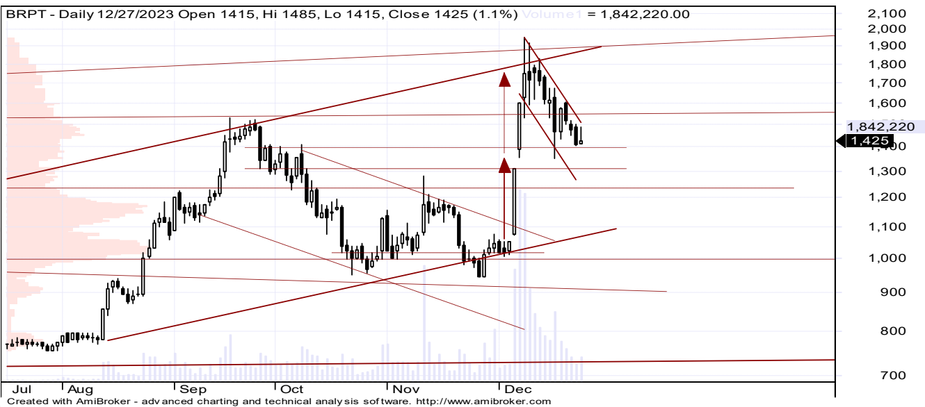
BRPT (last 1425) - SELL. Target 1370-1310. Cover >1470. Selling in down channel