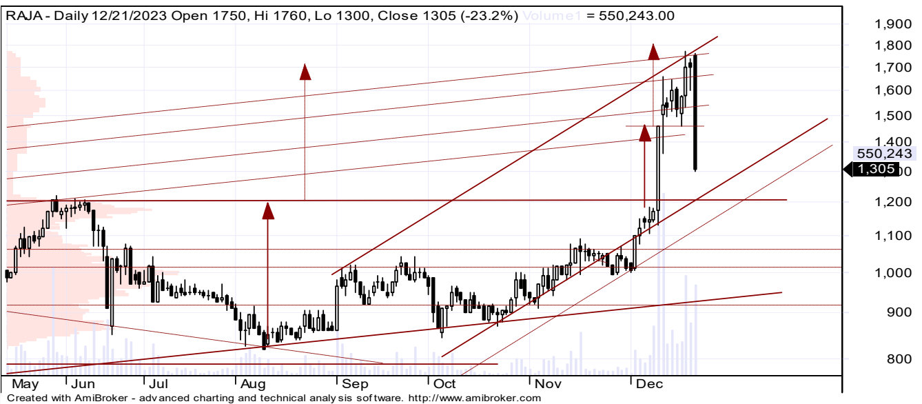
RAJA (last 1305) - SELL. Target 1235-1150. Cover >1425. Selling near target