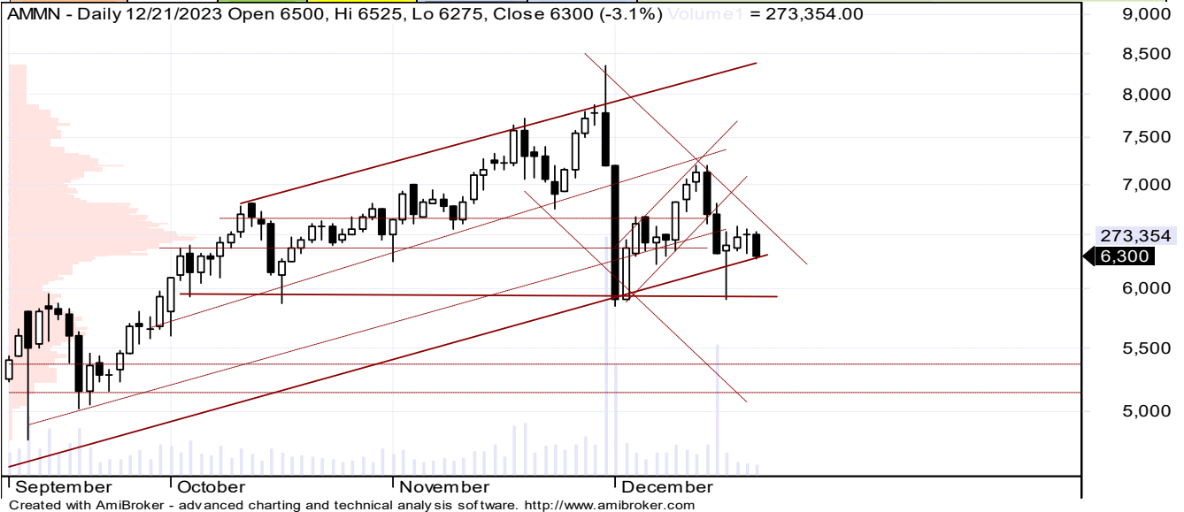
AMMN (last 6300) - SELL. Target 6200-5850. Cover >6550. Selling in consolidation