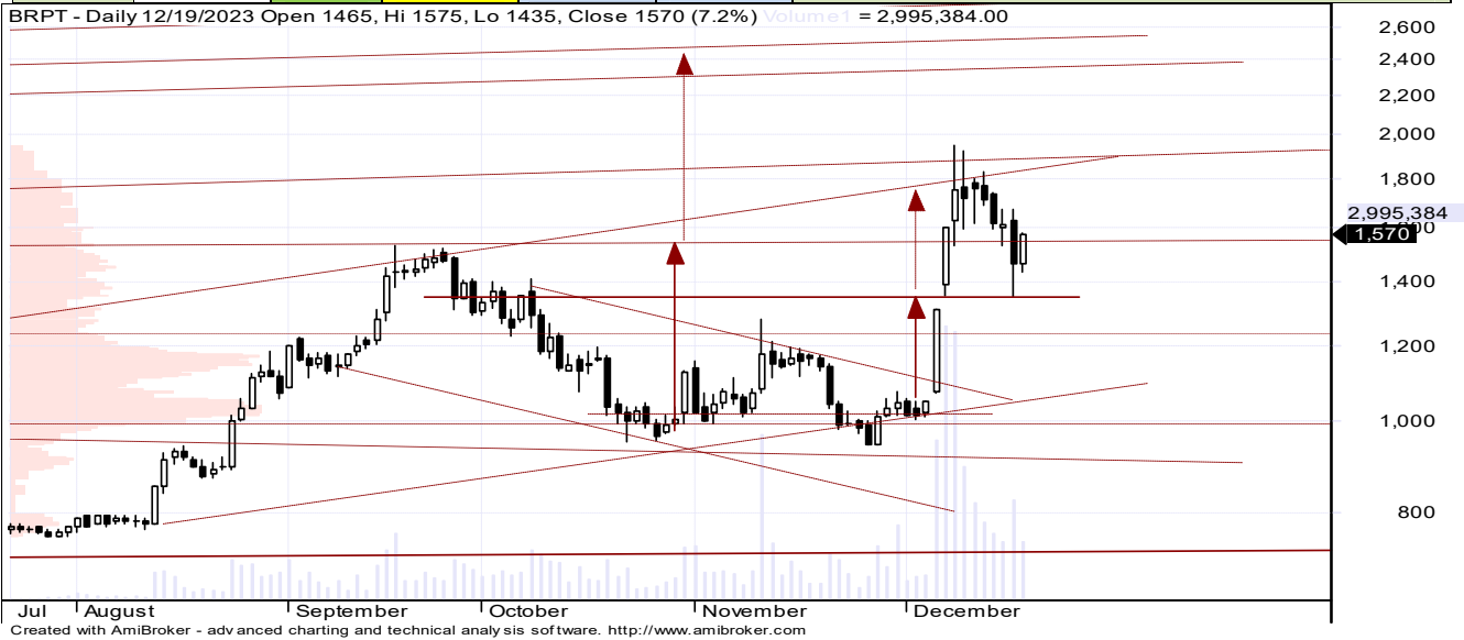
BRPT (last 1570) - BUY. Target 1630-1670. Cutloss <1505. Rebound from support