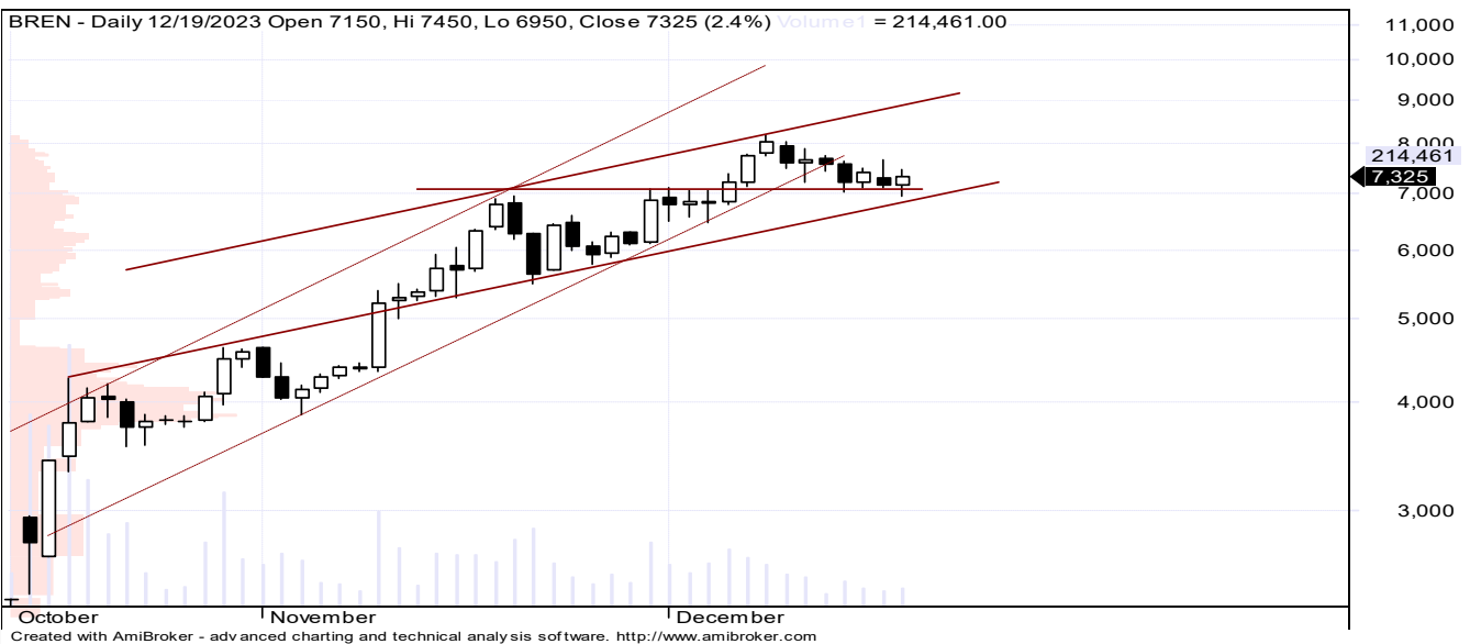
BREN (last 7325) - BUY. Target 7975-8150. Cutloss <6875. Intraday buying near support