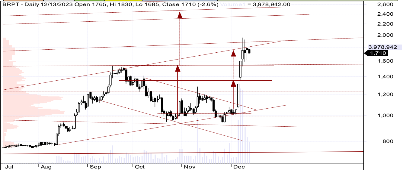
BRPT (last 1710) - SELL. Target 1620-1550. Cover >1780. Selling at target