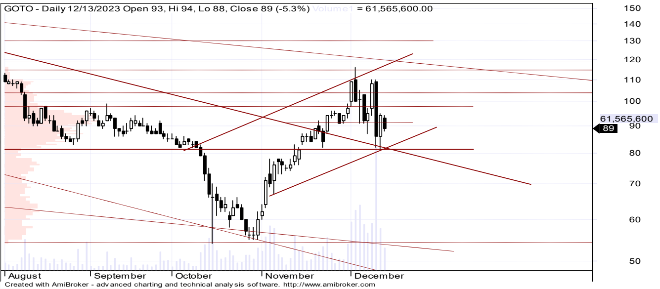
GOTO (last 89) - SELL. Target 86-82. Cover >92. Selling in consolidation