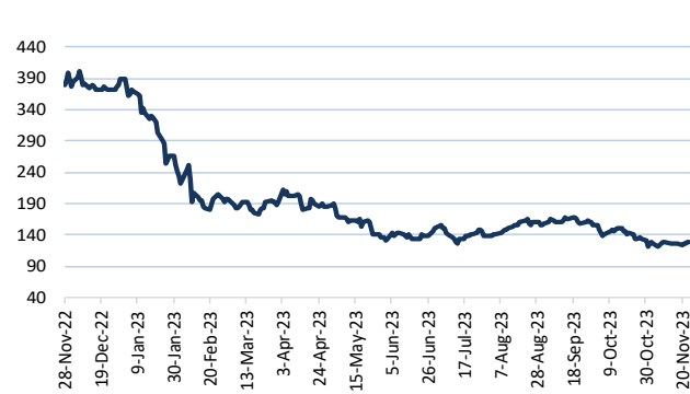
Coal: Newcastle Coal (USD/MT)