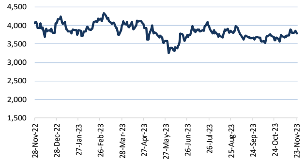
CPO: Bursa Malaysia Crude Palm Oil (MYR/MT)