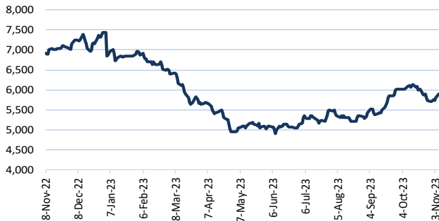
Pulp: Generic Bleached Softwood Craft Pulp (CNY/MT)