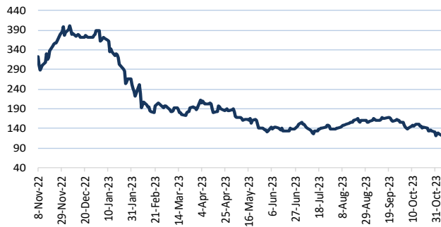
Coal: Newcastle Coal (USD/MT)