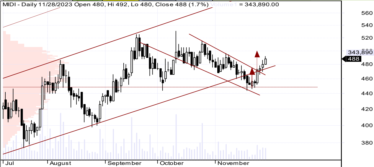
MIDI (last 488) - BUY. Target 500-505. Stop <485. Bullish after downchannel breaks out