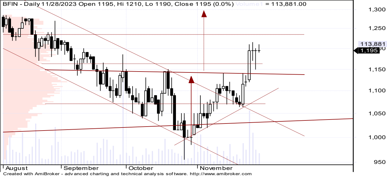
BFIN (last 1195) - BUY. Target 1225-1275. Stop <1160. Inverted Head and Shoulder