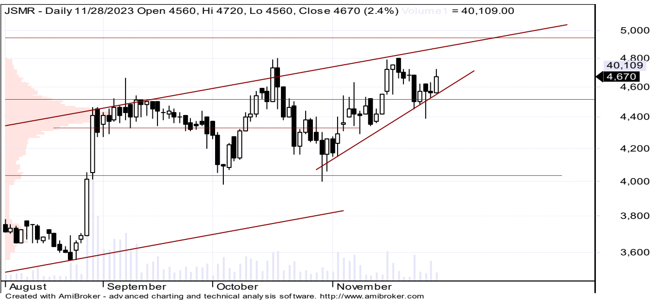
JSMR (last 4670) - BUY. Target 4800-4950. Stop <4600. Rebound from support