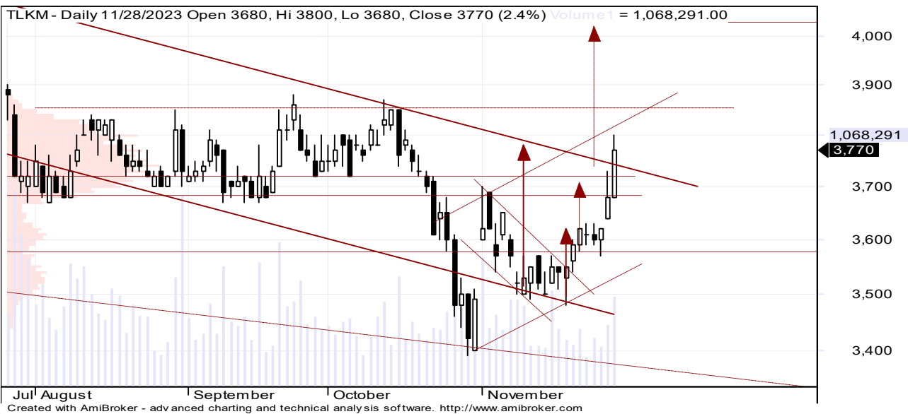
TLKM (last 3770) - BUY. Target 3835-3870. Stop <3740. Buying power in upchannel