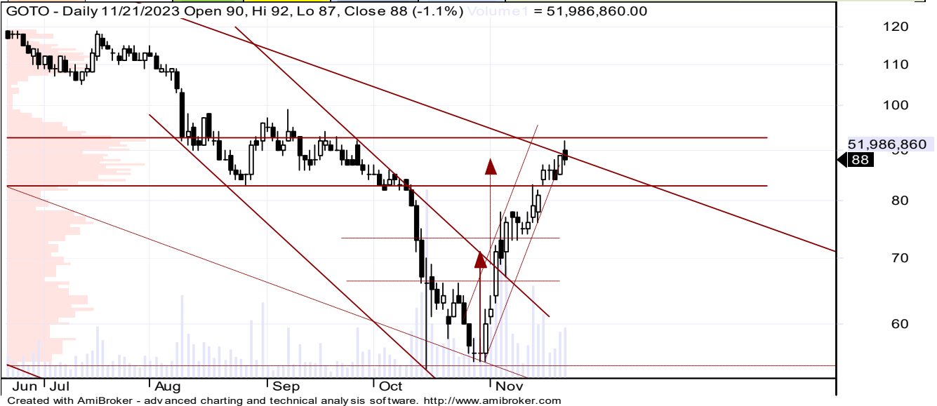
GOTO (last 88) - SELL. Target 83-80. Stop <93. Selling near strong resistance