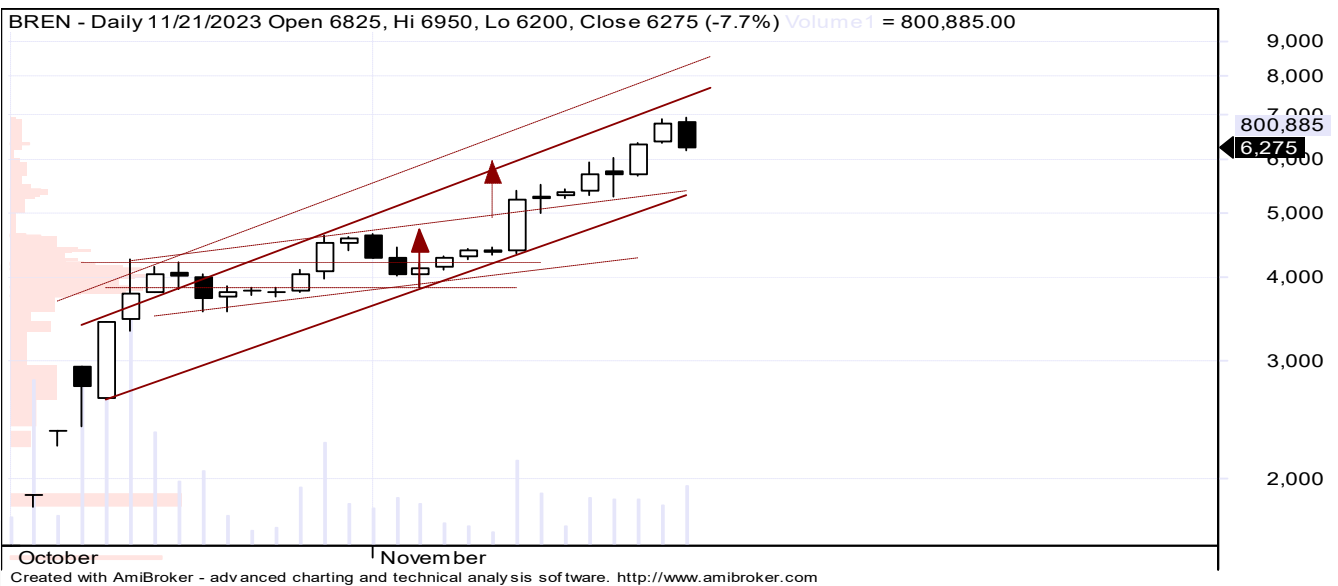
BREN (last 6275) - SELL. Target 5925-5375. Stop <6825. Selling in upchannel