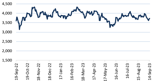
CPO: Bursa Malaysia Crude Palm Oil (MYR/MT)