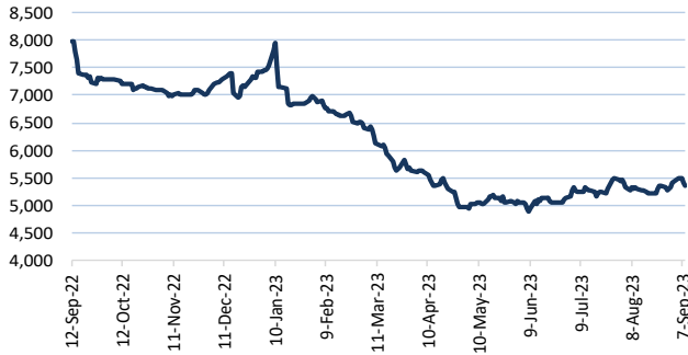
Pulp: Generic Bleached Softwood Craft Pulp (CNY/MT)