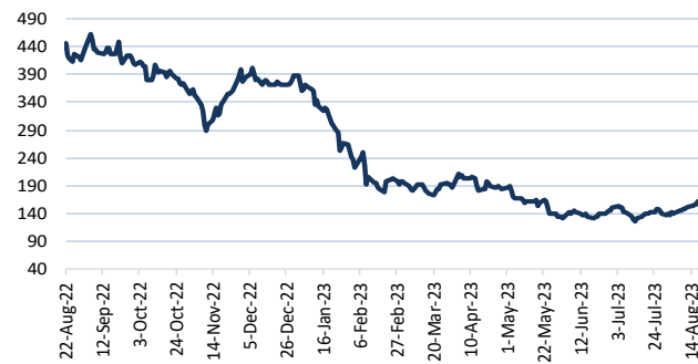
Coal: Newcastle Coal (USD/MT)