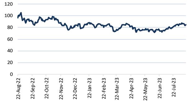
Oil: Generic 1st Crude Oil, Brent (USD/Barel)