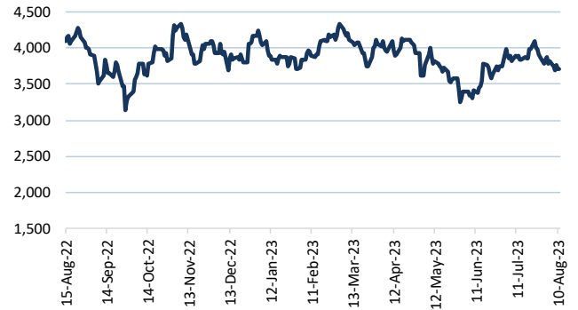
CPO: Bursa Malaysia Crude Palm Oil (MYR/MT)