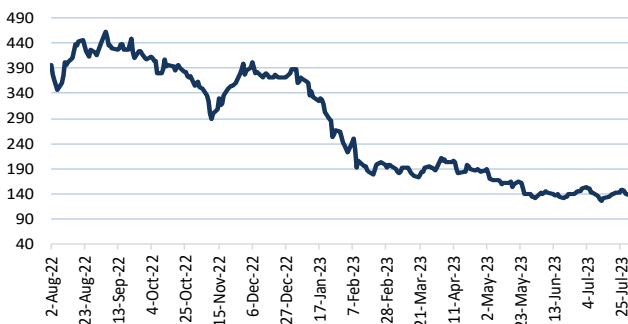
Coal: Newcastle Coal (USD/MT)