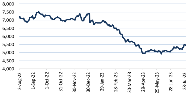
Pulp: Generic Bleached Softwood Craft Pulp (CNY/MT)