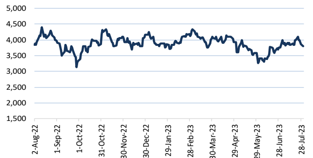
CPO: Bursa Malaysia Crude Palm Oil (MYR/MT)