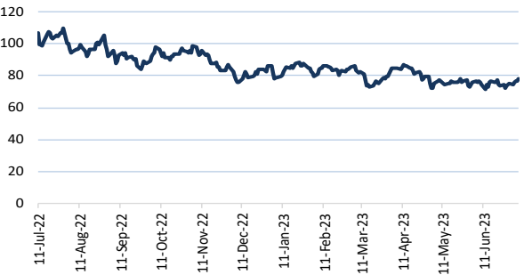
Oil: Generic 1st Crude Oil, Brent (USD/Barel)